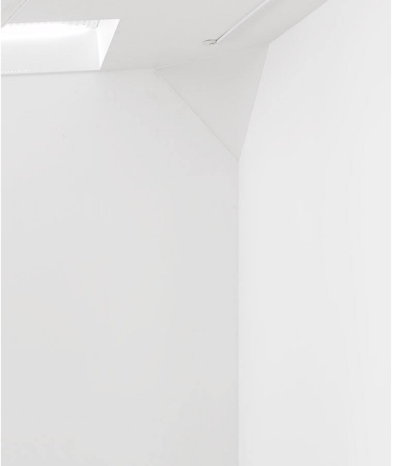
Corner Volume mounted in the corner of the ceiling