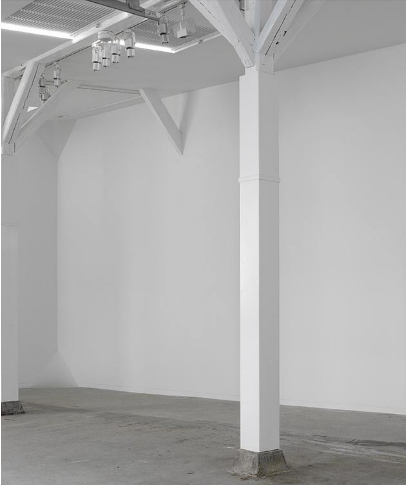
Installation view. From the exhibition New Works at Kirkhoff, Copenhagen, DK