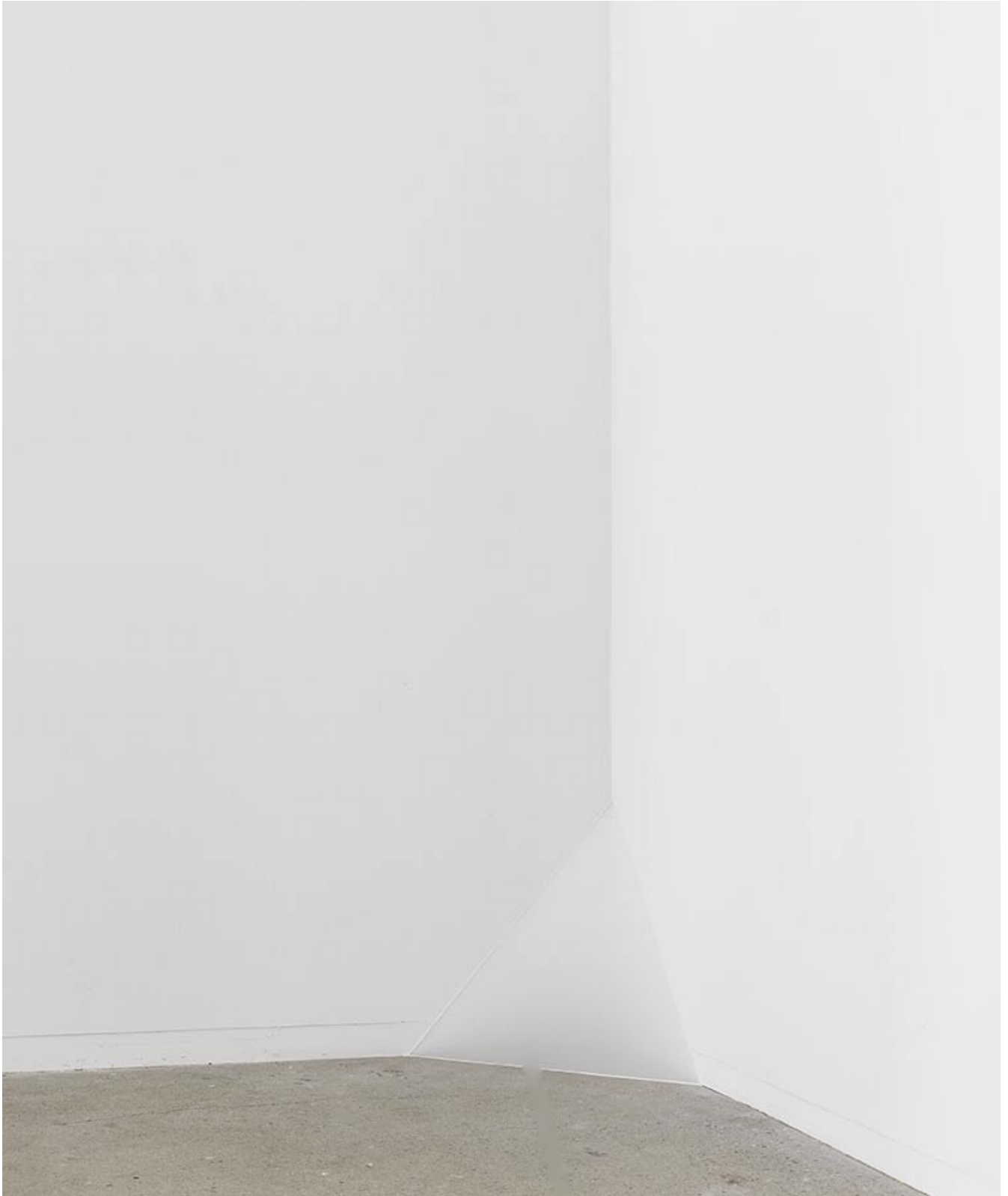
Corner Volume mounted in the corner of the floor